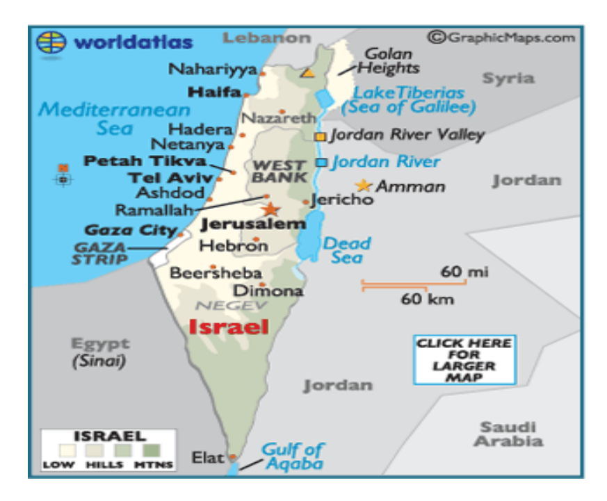
Fig. 2 Egypt, Israel and Palestinian Territory<sup>32</sup>

traverses north to northeast into Israeli territory. Israel draws 75% of its resources, while Palestinians use up to 25% of its resources.<sup>31</sup>